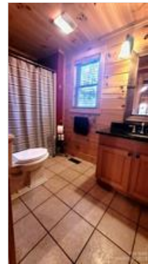
Main Level Bathroom