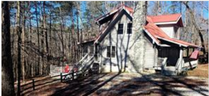
Side of Home