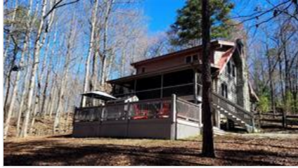
Back of Home