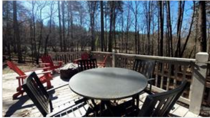
Plenty of room to enjoy the scenery