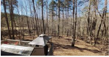
View of back from screened-in porch