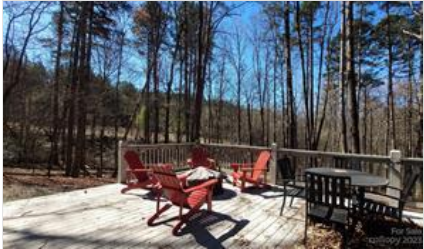
Enjoy nature while you dine