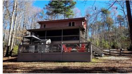
Back of Home