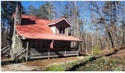
Front of Home