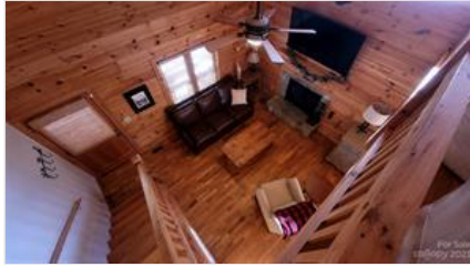
View down from loft