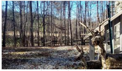
Large, private back yard