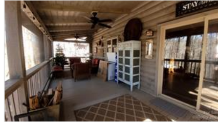
Screened in back porch