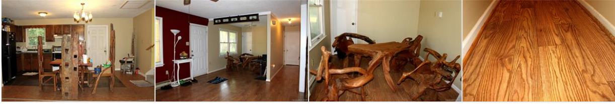
Teak Dining Furniture